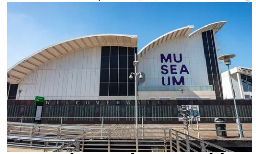
Australian National Maritime Museum