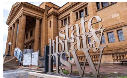
State Library of New South Wales