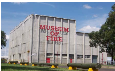
Museum of Fire