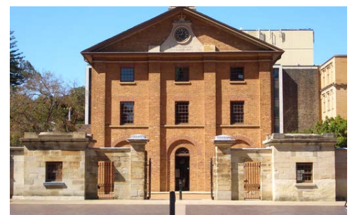
Hyde Park Barracks