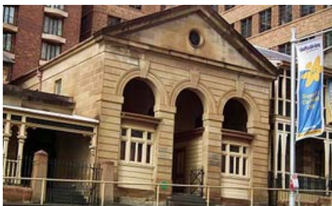
Justice and Police Museum