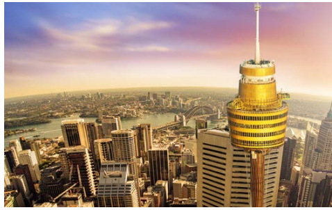
Sydney Tower Eye