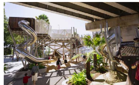
Playground at Darling Quarter