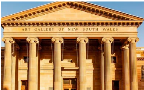
Art Gallery of New South Wales