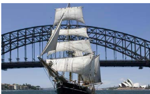
Sydney Harbour Tall Ships