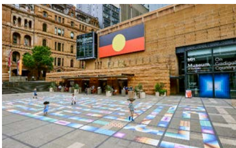
Museum Of Sydney