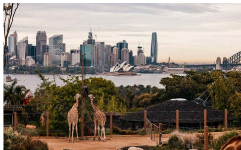
Taronga Zoo Sydney