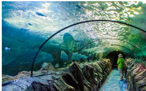
Sea Life Sydney Aquarium