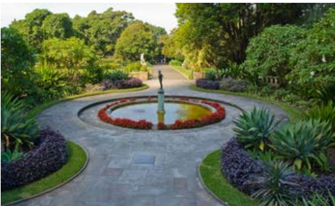
Royal Botanic Garden Sydney