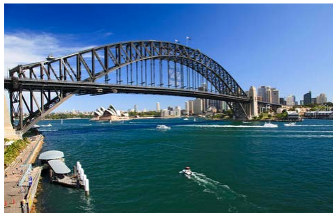
Sydney Harbour Bridge