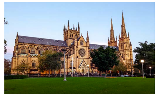
Saint Mary's Cathedral