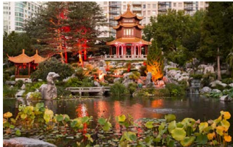
Chinese Garden Of Friendship